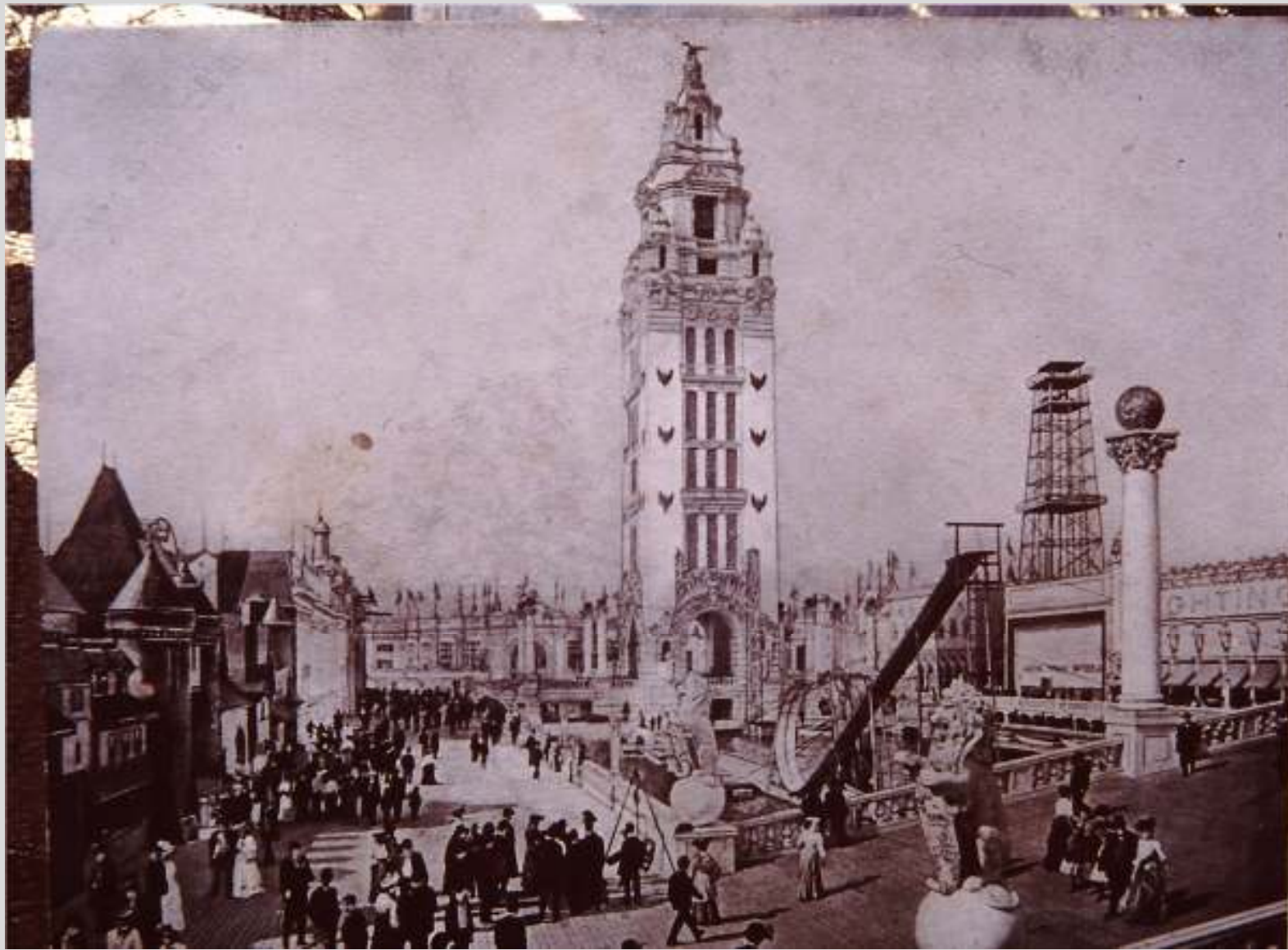
8077 GENERAL VIEW OF DREAMLAND, CONEY ISLAND, N. Y. ILLUSTRATED FIRST CARD CO., N. Y.