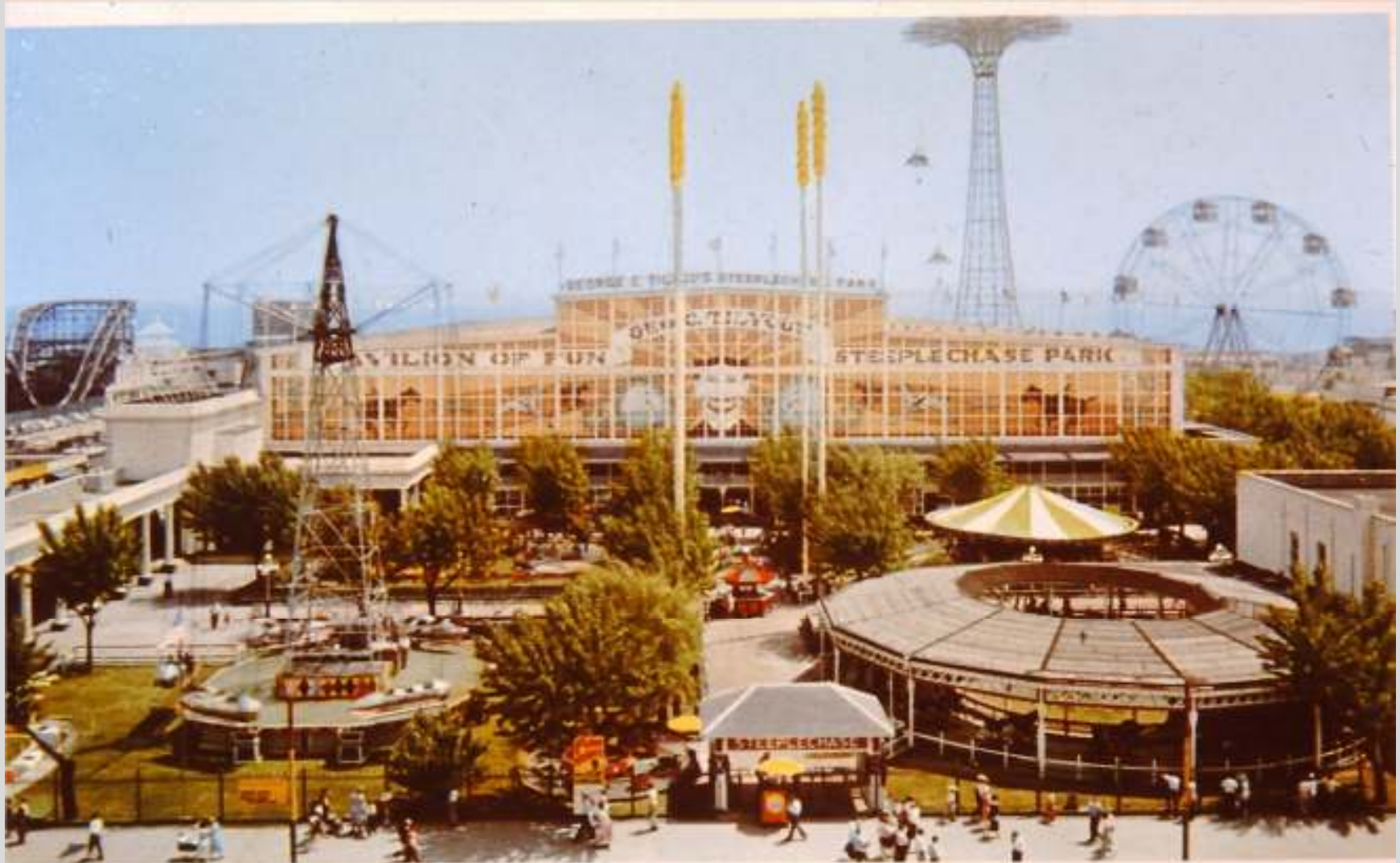
Steeplechase Park, Coney Island