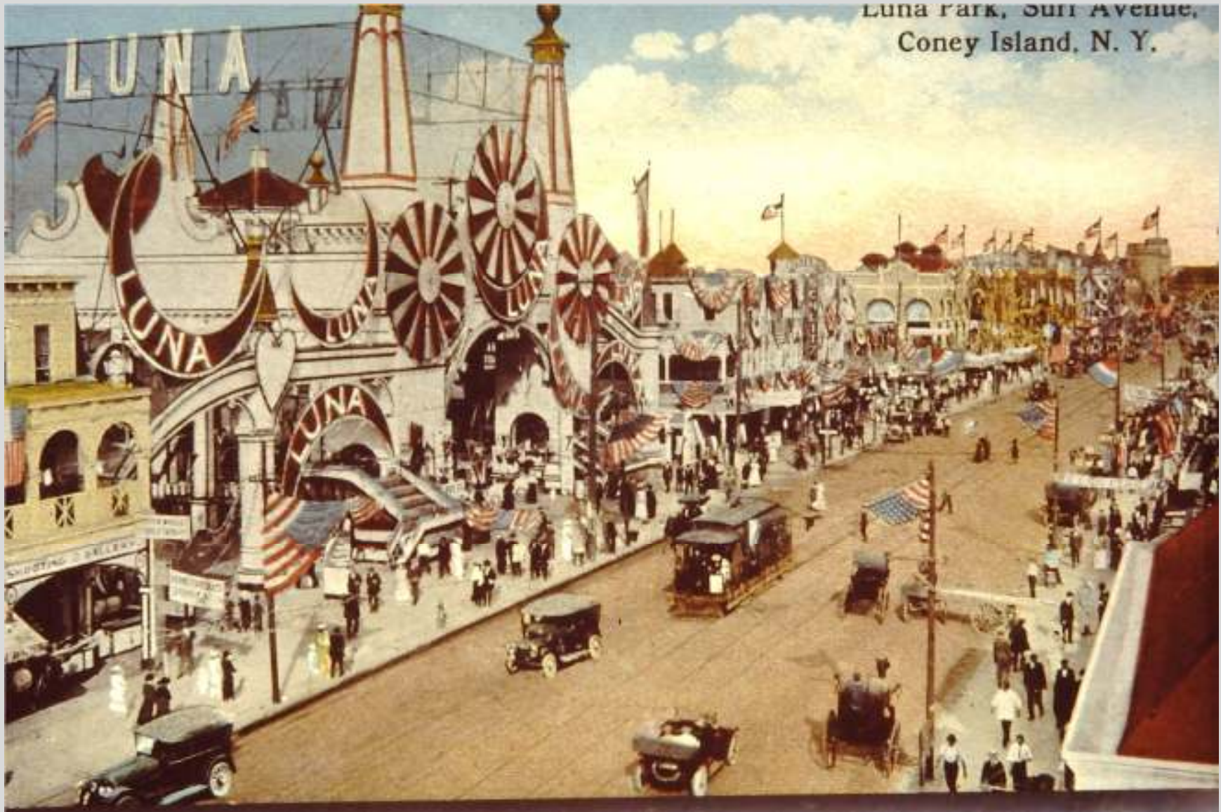
Luna Park, Surf Avenue, Coney Island, N. Y.